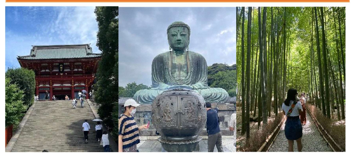
Hachimangu Shrine / Kotokuin Temple / Hokokuji Temple