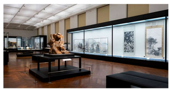
Tokyo National Museum