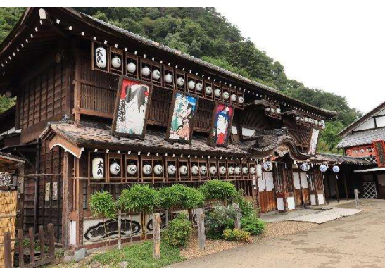
Theater in the Edo wonderland