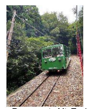
Ropeway to Mt. Tsukuba