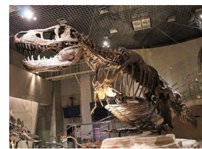
National Museum of Nature and Science